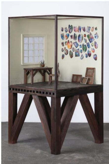
Stepping Out of the Studio Ni Youyu Mixed media 80 × 80 × 151 cm 2020 Courtesy the artist