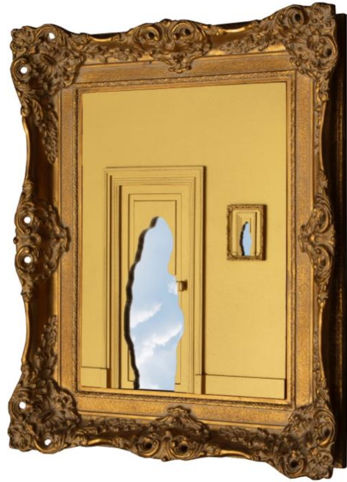
Double Unexpectedation II Ni Youyu, Mixed media, 60 × 50.5 cm, 2022

The exhibition takes place at He Art Museum, designed by architect Tadao Ando, to correspond to the context of Ni Youyu's work, the implied three traditional elements of "the heaven, the earth and the mankind". With all his creativity, the artist constitutes a finite and always hovering scale, measuring the dome of infinite space and time above.