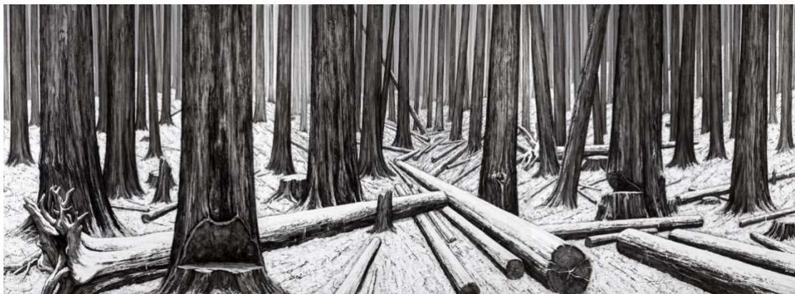
Relic , Ni Youyu, Mixed media on canvas, 220 × 600 cm, 2018, Courtesy the artist

He Art Museum (HEM) is to present Dome & Scale , the largest solo exhibition of artist Ni Youyu to date. Opens on August 27 th , 2022, the exhibition curated by Zhu Zhu features over 100 works in a variety of forms, including painting, installation, sculpture, image collage, woodcut, photography, and video that will showcase the artist's creative practice from 2008 to 2022.