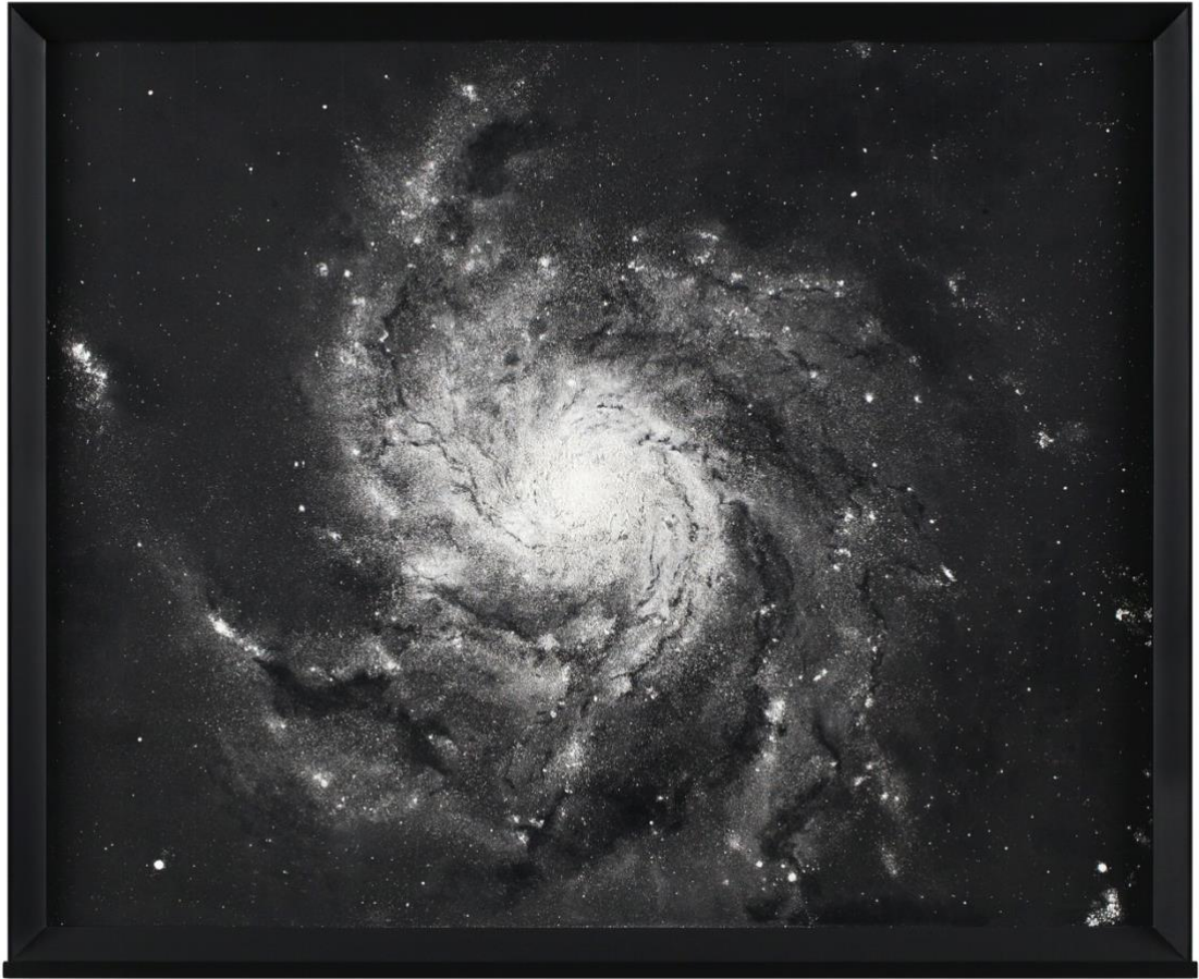
Dust VII (Pinwheel Galaxy: heic0602) , Ni Youyu, Mixed media, 131×160 cm, 2015, Courtesy the artist