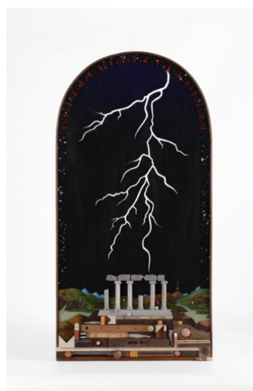
From left: Comet II Ni Youyu Mixed media 45 × 31 × 6 cm 2022 Dome & Scale Ni Youyu Mixed media 78 × 40 × 7 cm 2022