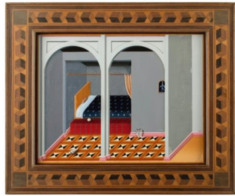
From left: Peep , Ni Youyu, Acrylic on canvas, 31 × 47 cm, 2021; The Interpretation of Dreams III , Ni Youyu, Mixed media on canvas & antique frame, 37 × 44.5 cm, 2022