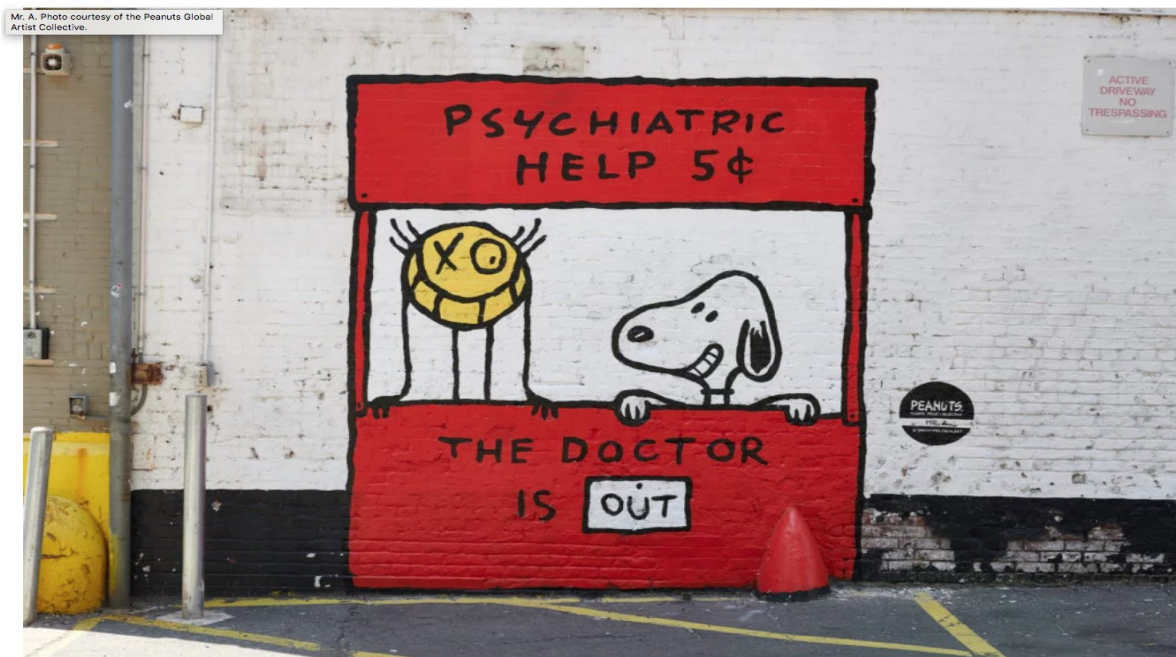
Mr. A.

Good grief! A corporate public art project has hit the streets of cities around the world, all based on Charlie Brown, Linus, Lucy, and other characters from Charles M. Schulz ’s beloved Peanuts comic strip. A clever bit of marketing for Snoopy and the gang, the murals have touched down in New York, with installations to follow in Mexico City, Paris, Berlin, Tokyo, San Francisco, and Seoul.