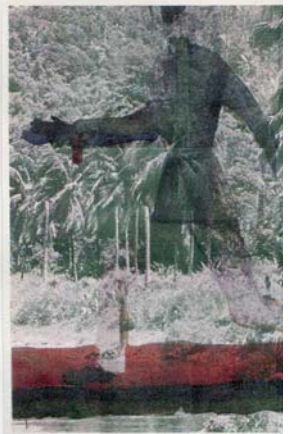
CLOCKWISE FROM TOP RIGHT: Untitled , 2012. Inkjet monoprint, sprayed with clear gloss UV protection, 50½ x 72½ in.